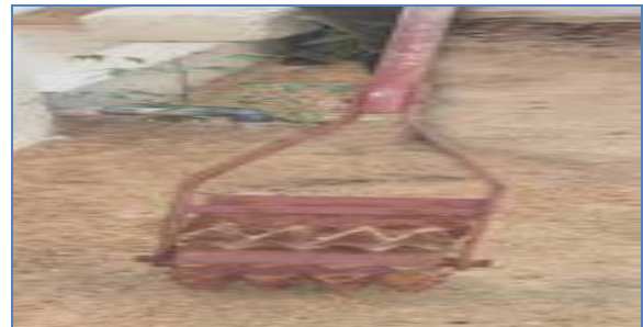
Single Drum Weeder

The weeders that are available in the market are a bit costly. There are some problems with the design also. When these are being used in heavy soils, there are several problems. Different weeders were studied and by combining the advantages of each one, a new 'mandava' weeder has been designed. The weeder got its name after 'Chinna Mandava', a village in Khammam District in Andhra Pradesh, where it has been tested and fine tuned.