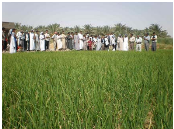
Rice-growing farmers visiting SRI fields

Farmers were trained on how to produce organic manure from their farm materials three month before date of sowing.