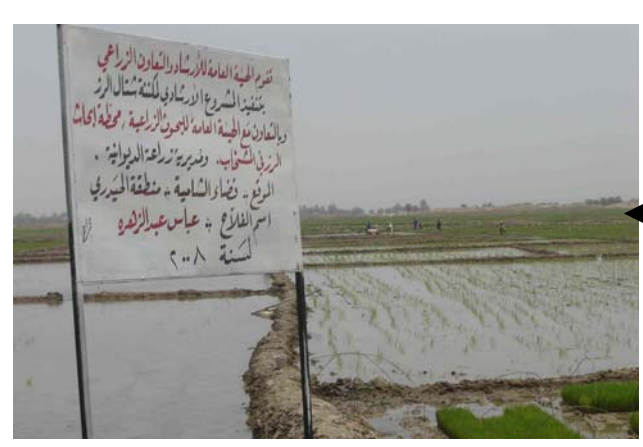
One mechanically-transplanted field