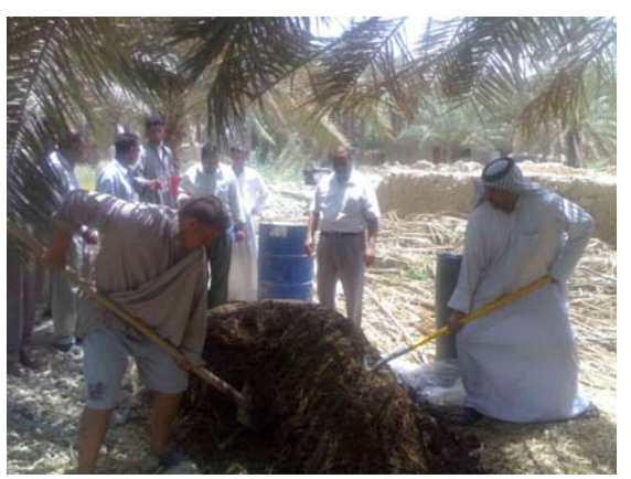
Producing organic manure on-farm by farmers

The fields were prepared and nurseries were established, with boxes for seedlings sown and transferred to the nursery. Transplanting in the field was done with proper