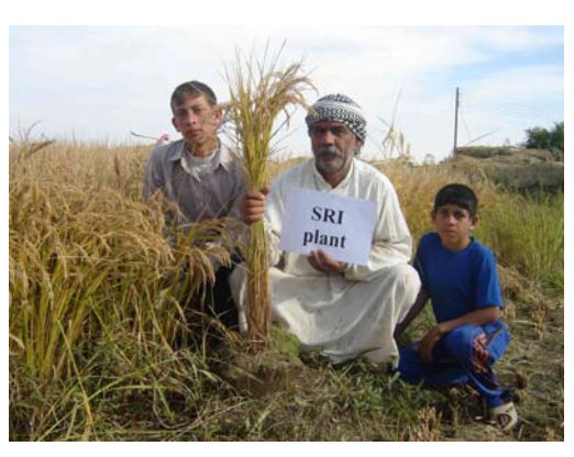
High yield with SRI plant