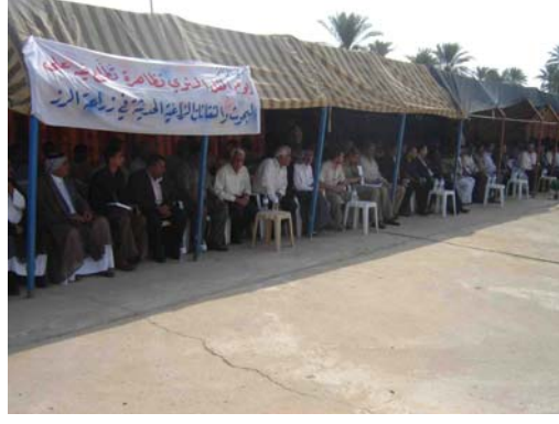
View of the audience