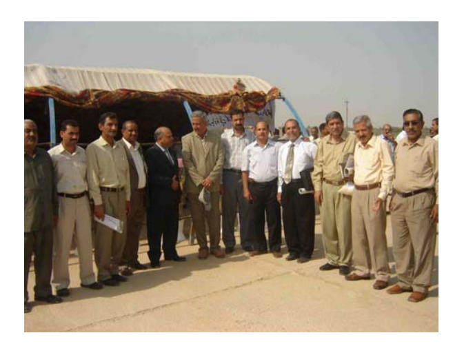
Professionals from many institutions attending