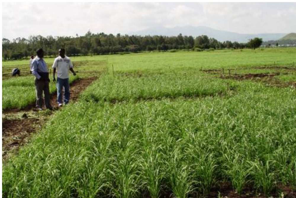
Figure 5. Three weeks after transplanting