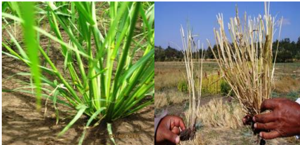
Figure 1. Photos showing tillering potential of transplanted tef during growth on the left, and after harvest on the right, with a 'normally' grown plant on the right.

The main effect of transplanting (as indicated in the following figures ) was in increasing tiller number, producing strong and fertile tiller culms, and in increasing the number of seeds/panicle.