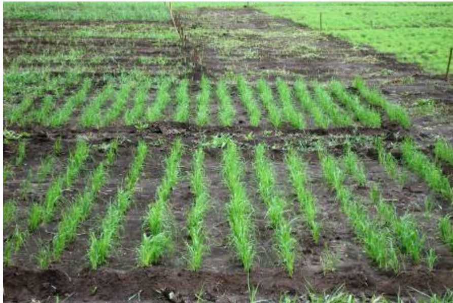
Figure 4. Ten days after transplanting