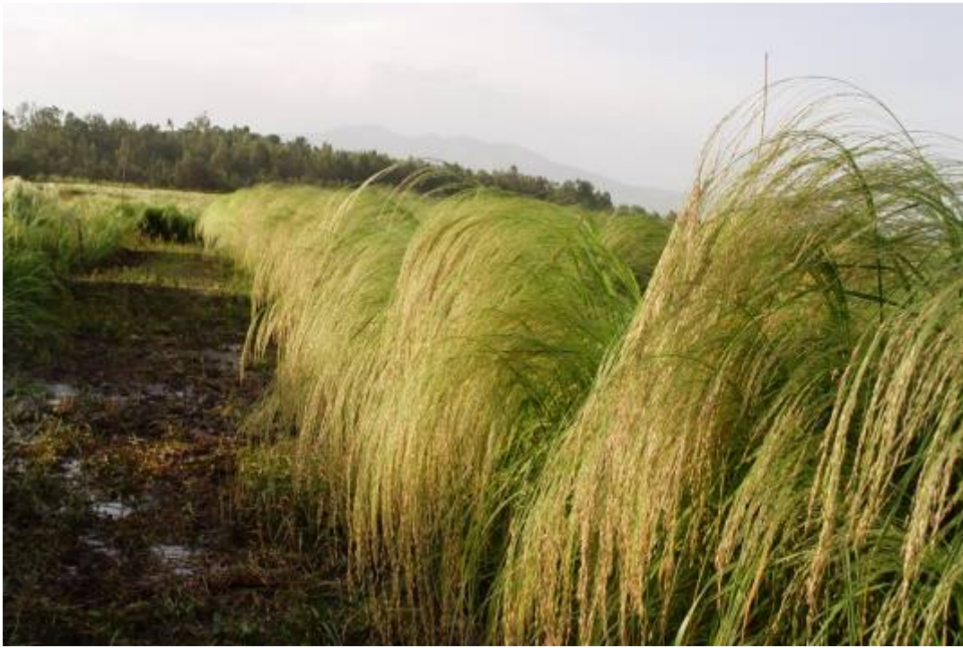
Figure 8. Grain filling stage