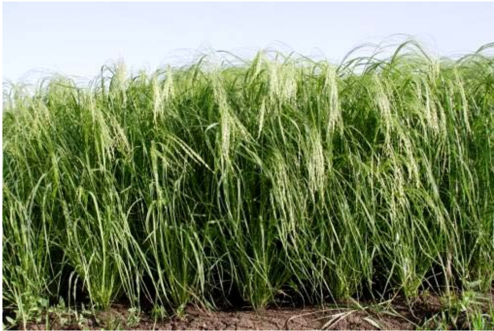
Figure 6. Five weeks after transplanting