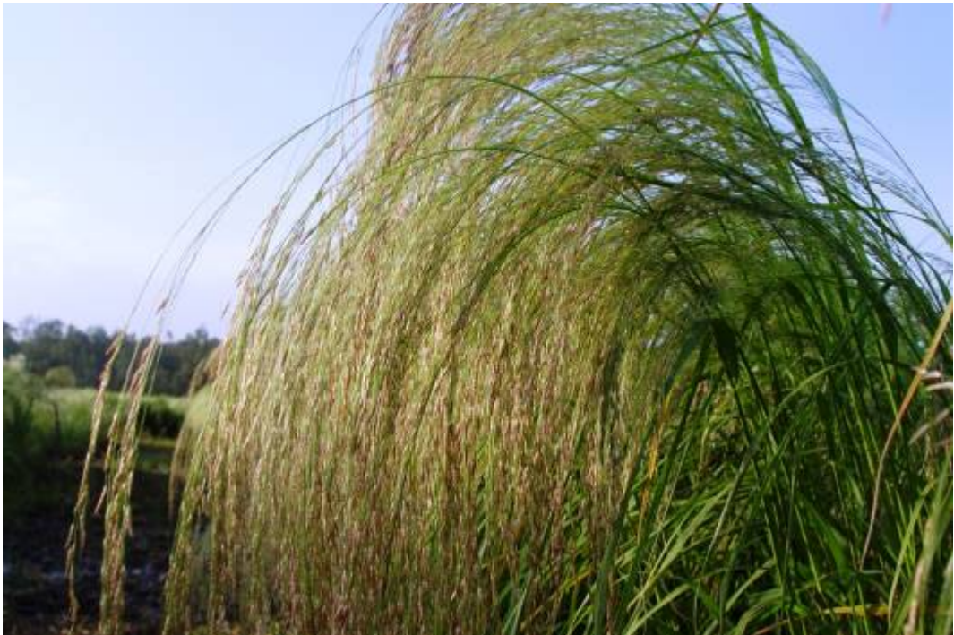
Figure 7. Grain filling stage