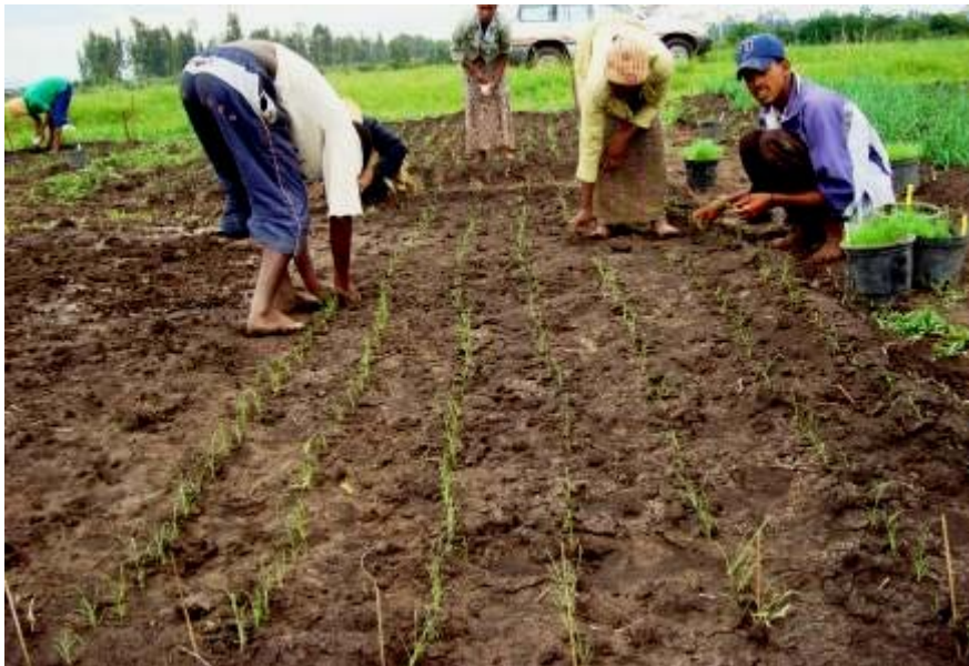
Figure 3. Two-week old seedlings being transplanted

The third experiment used three varieties (DZ-01-Cross 387 = Kuncho, DZ-01-974 and Gyno 8). The same fertilizer treatments were used as in Experiment 2. The difference is that this was a field experiment with plot sizes of 20 m 2 . Tef seedlings were grown in pots for two weeks and then transplanted in rows 20 cm apart with 15 cm between hills. Three seedlings/hill were used in transplanting. The following pictorial figures show the different stages of tef development in this experiment.