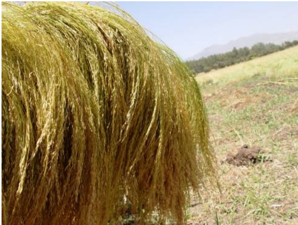
Figure 9. Tef at maturity stage