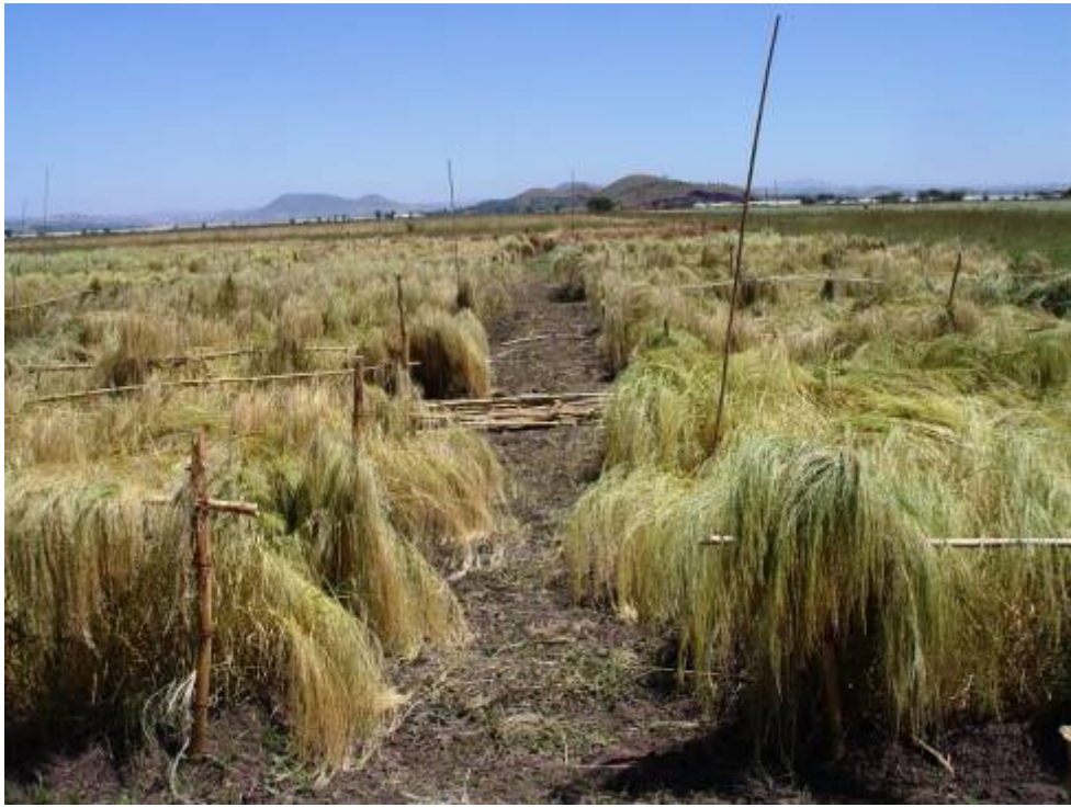
Figure 8. Panicles so heavy with seed that they needed support to prevent lodging