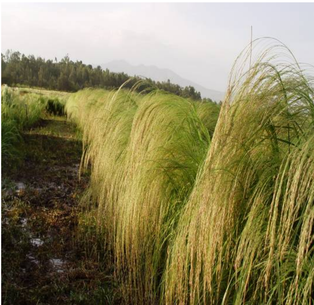
Tef at maturity in the Debre Zeit Research Center in 2009