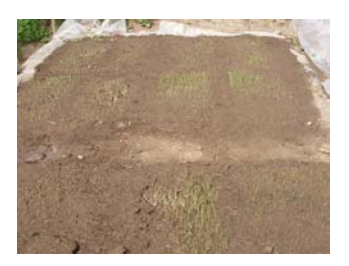
Raising seedlings in nursery