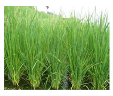
Flowering stage (SRI plot)