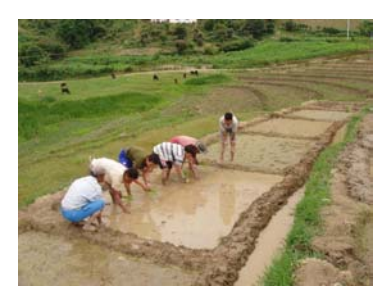
Transplanting at 3-leaf stage