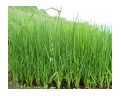
Flowering stage (control plot)