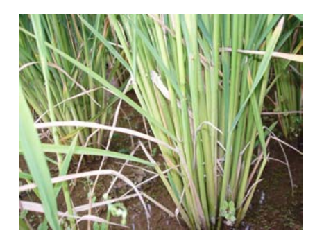
Large number of tillers with SRI methods (47 tillers)