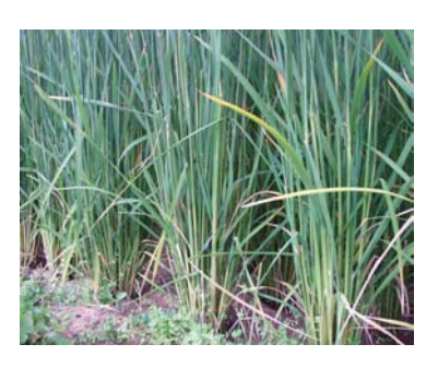
Robust and profuse tillering with SRI methods