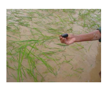
Transplanted seedlings at random in control plot