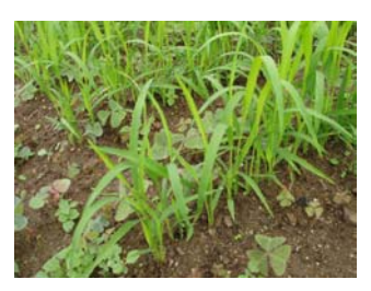
3-leaf stage seedling age