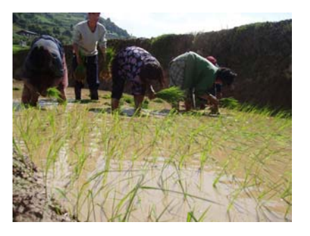
Transplanted seedlings at random in farmer's field