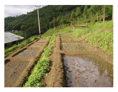
Transplanted seedlings in square pattern