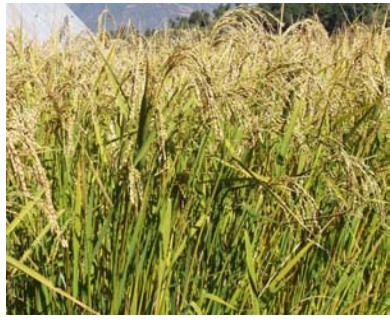
SRI plot almost ripe for harvest