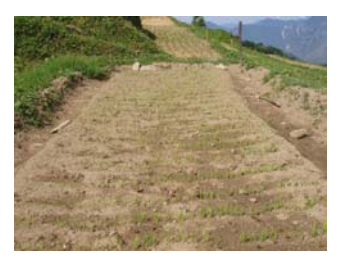
Raising seedlings in nursery