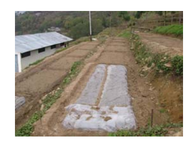
Nursery bed treatment (solarization technique)